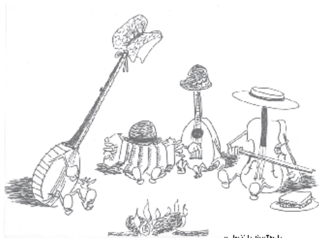
Illustration by Valerie Doyle

This is a do-it-yourself weekend; bring food, camping equipment, chairs and acoustic instruments, and play, sing and make music all weekend among the redwoods of Santa Cruz County!