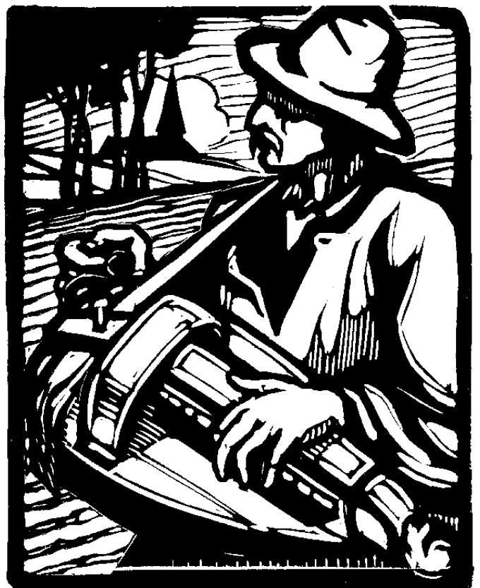
Fernand Chalandre, 1919, British Museum Collection