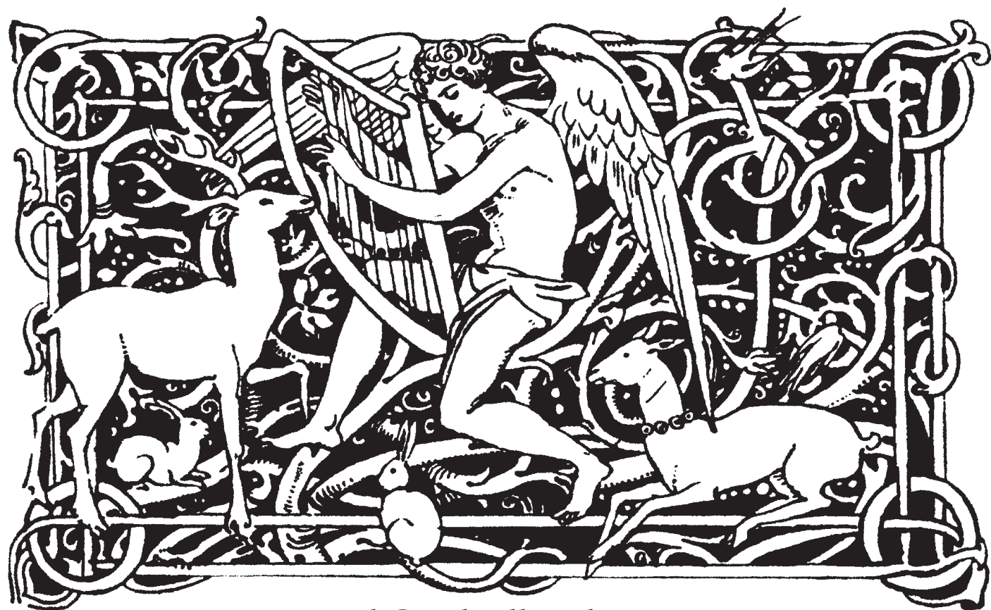
To Peace and Goodwill in the coming year.