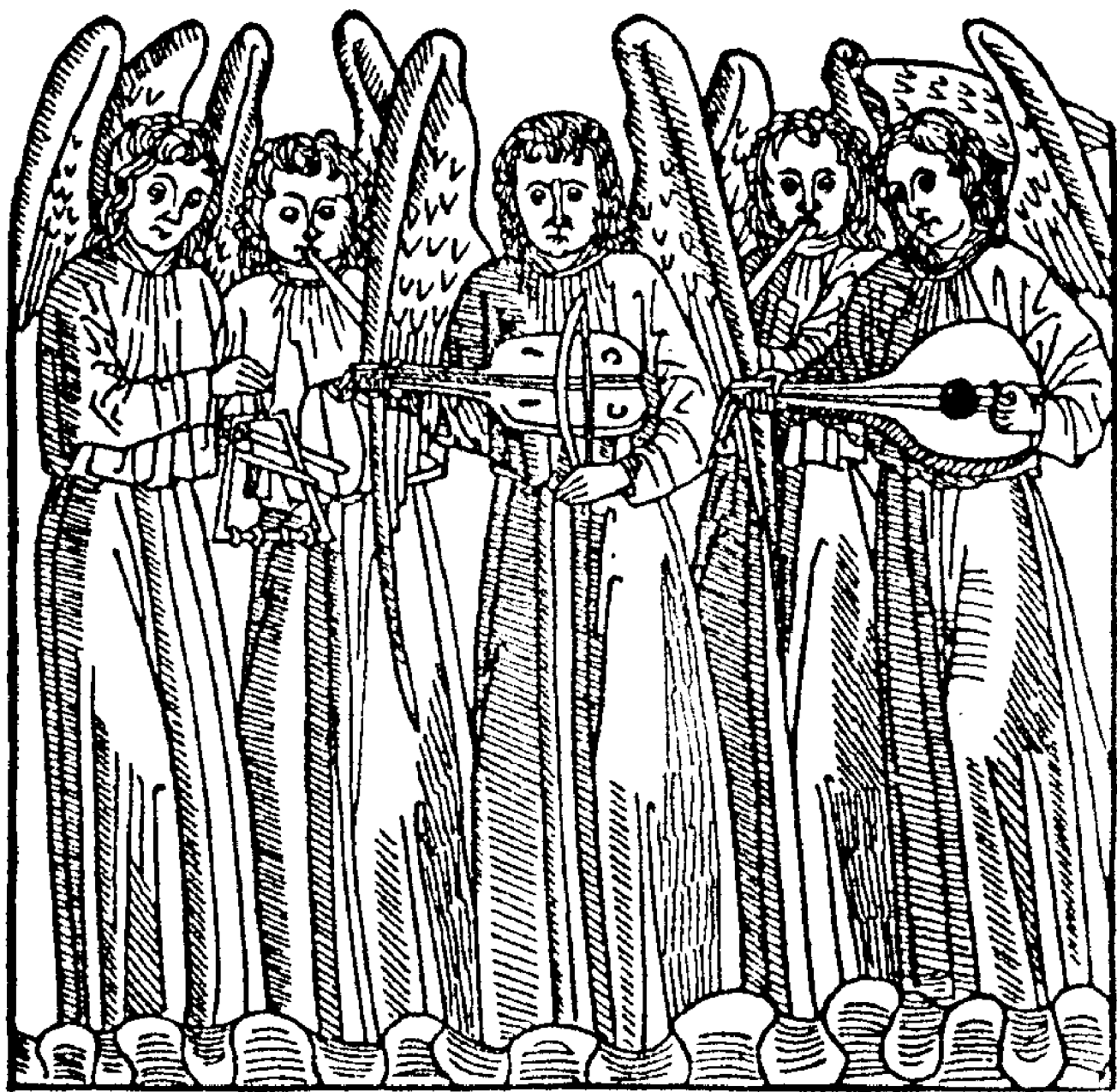
The Angel Band.