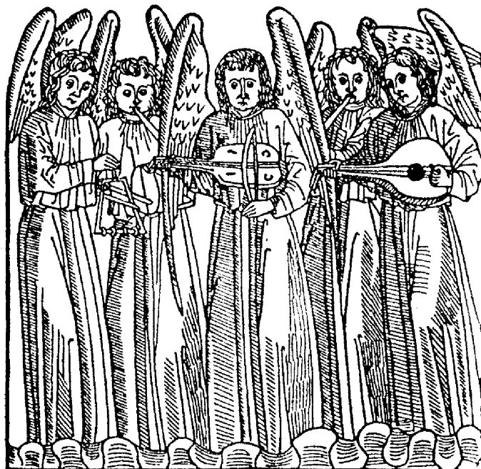
Angel Band window at 885 Clayton St.

On November 29, we held the last of our Musical Meetings at 885 Clayton Street and said farewell to the “angel band” window, the singing room and fireplace and all of the other old favorite rooms.